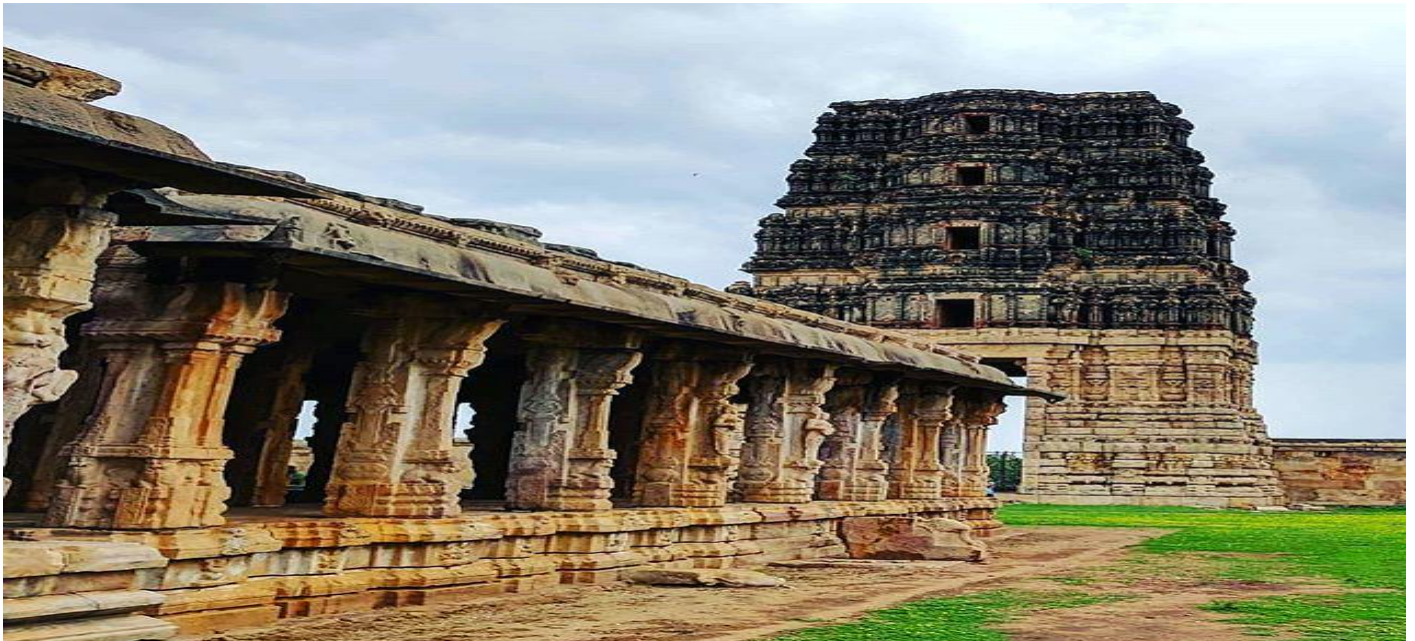
Madhavaraya Temple is a 16th century Hindu temple located in the Gandikota Fort, in the Kadapa district of Andhra Pradesh, India. Dedicated to Krishna, it is also known as Madhava Perumal Temple or Madhavaraya Swamy Temple. The Government of India has designated it as a Monument of National Importance.