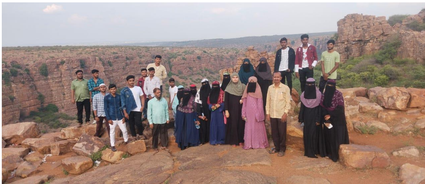
At a distance of 1 km from Gandikota Bus Stop, Pennar River Gorge is a viewpoint situated in the small village of Gandikota. Often called as the Grand Canyon of India, it is one of the must visit places in Gandikota.