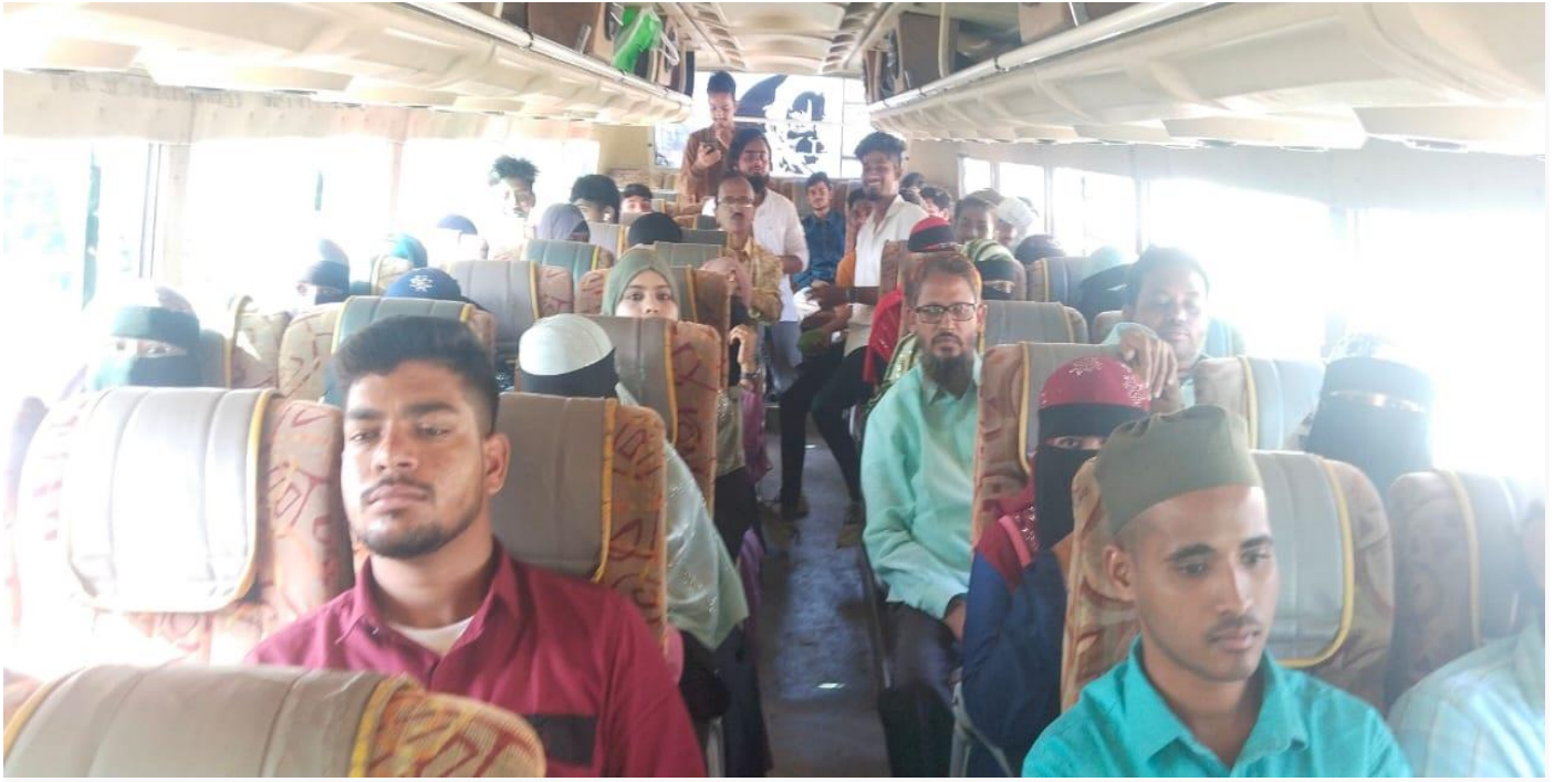
The Staff and Students GDC Rayachoty to go the Gandikota in the bus maximum students present in the field trip 29-04-2023.